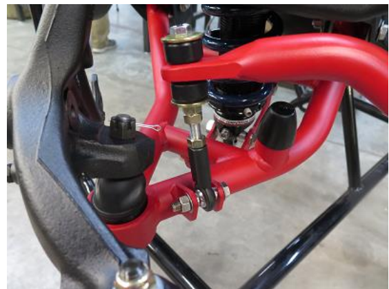
Figure 1: Completed Install