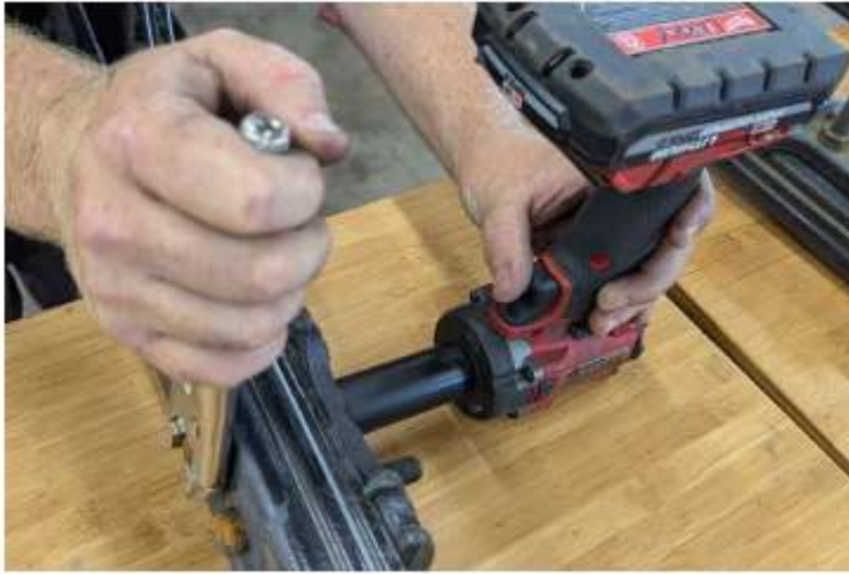
Figure 5: Leaf Spring Alignment Pin Removal

A) Now that both leaf springs are removed from the truck, the packs need to be modified to accept the flip bracket. Use a set of locking pliers to hold onto the leaf spring alignment pins (Fig 5) and remove the nuts with a 19mm socket. Remove the pins and set aside. These will be replaced with new pins. The nuts will be reused on the bottom side of the leaf spring.