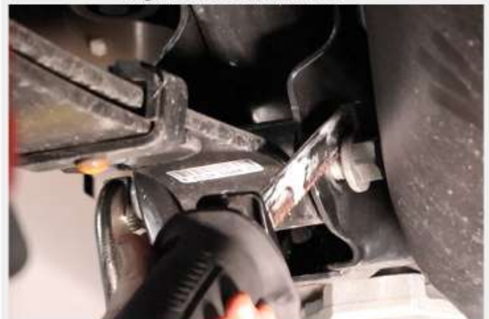
Figure 4: Cut Front Spring Mount Bolt