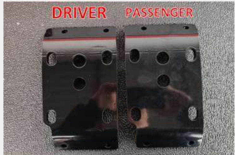
Figure 20: U-Bolt Clamp Plates