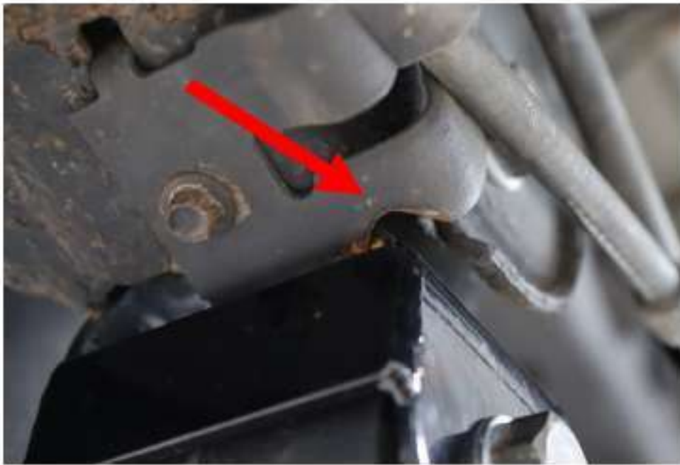
Figure 24: Clearance E-Brake Cable Mount

P) For 2015-17 trucks with a cable actuated E-Brake, the driver side mount securing the cable to the front leaf spring mount can now be reinstalled. Before doing so, the mount needs to be notched out slightly to fit with the new leaf spring mount. Use an angle grinder and remove material slowly stopping to check fitment. See Fig 24 for notch location. Torque factory installed mount bolts to manufacturer specs.