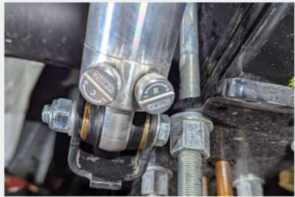
Figure 18: Driver Side Lower Shock Bolt

M) Use the provided 5/8 nuts and washers to secure the U-bolts to the clamp plate. (Fig 21). Torque U-Bolts nuts to 125 ft/lbs.