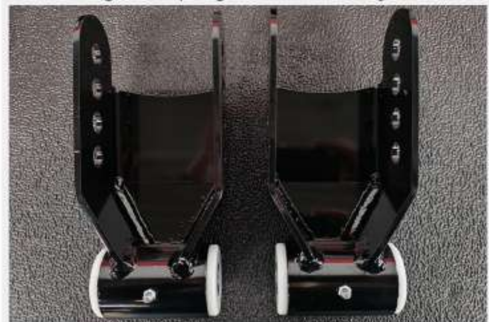
Figure 8: Adjustable Rear Shackles