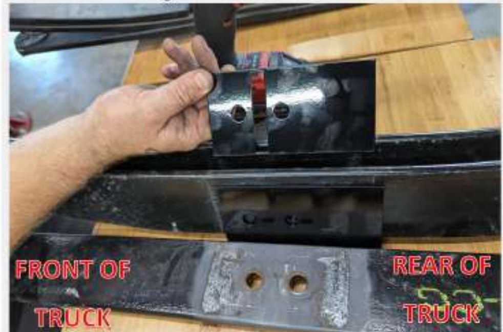
Figure 7: Spring Pack Reassembly