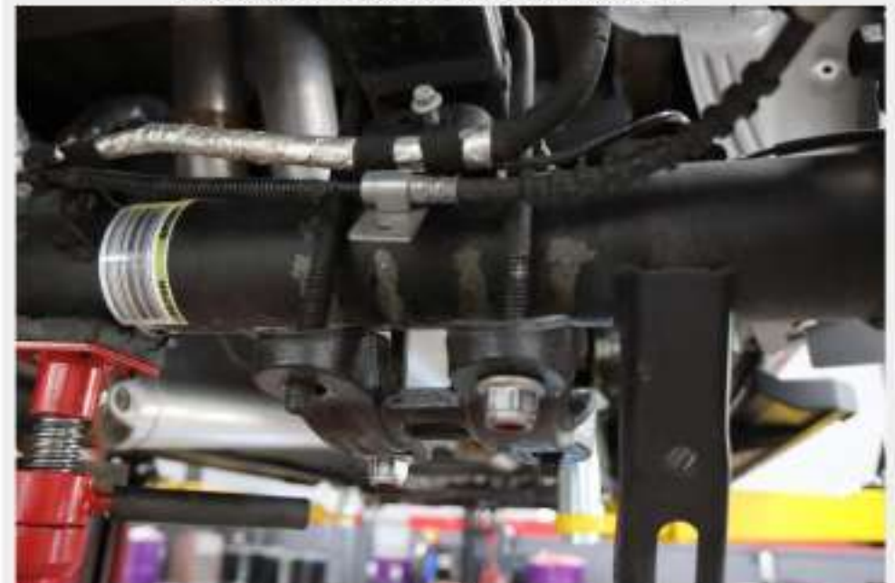
Figure 3: U-Bolt Removal