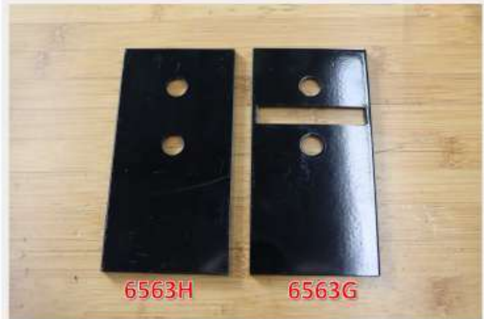
Figure 6: Offset Shims