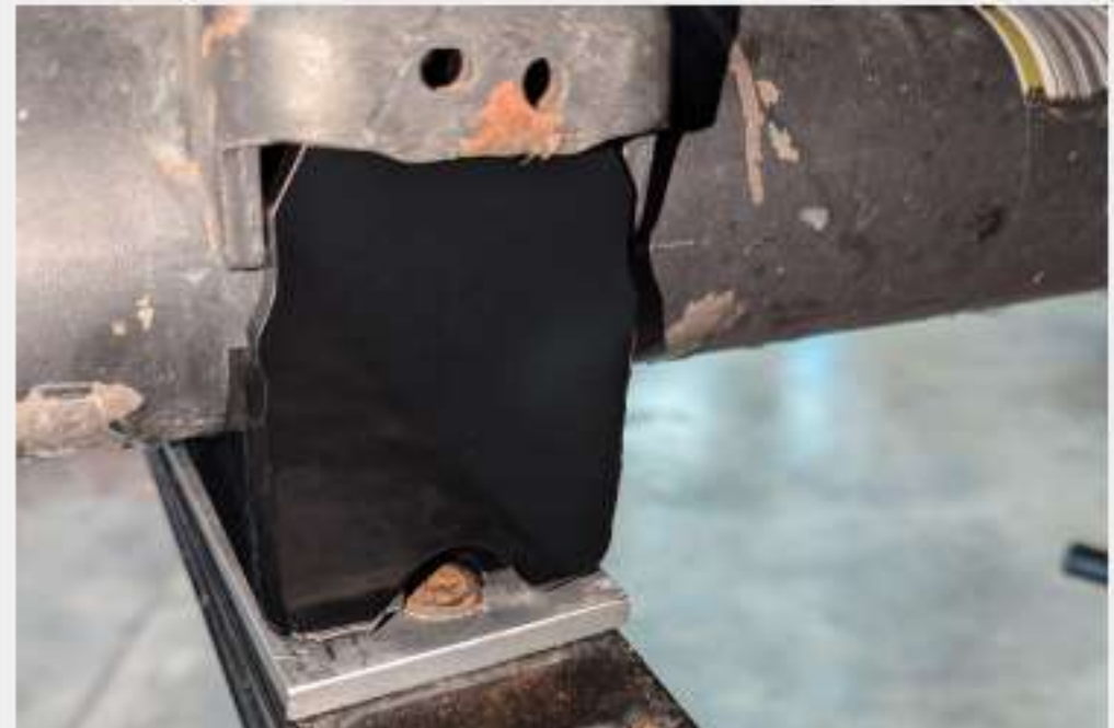
Figure 19: Seated Axle tube