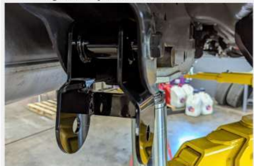
Figure 10: Installed Front Leaf Spring Mount