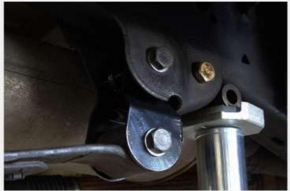
Figure 12: Installed Front Leaf Spring Mount