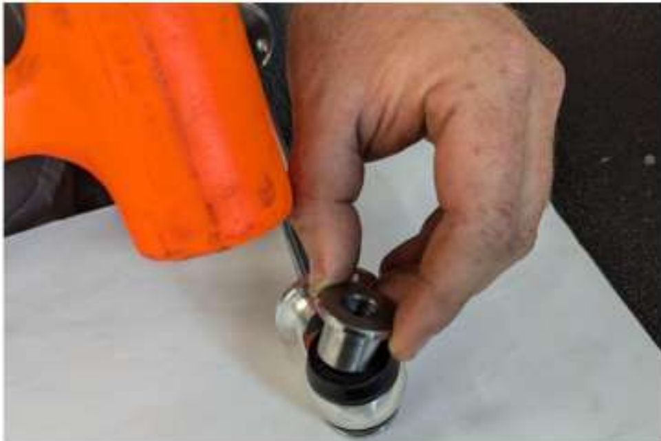
Figure 31: Shock Spacers Install

J) Now that the axle is sitting on top of the leaf springs, the viking shocks can be installed. Unbox the shocks and locate 6563R shock spacers. Install the shock spacers into the shock eye bushings using a dead blow hammer. (Fig 17). Use a silicon based lubricant such as SuperLube on the spacers and shock bushings