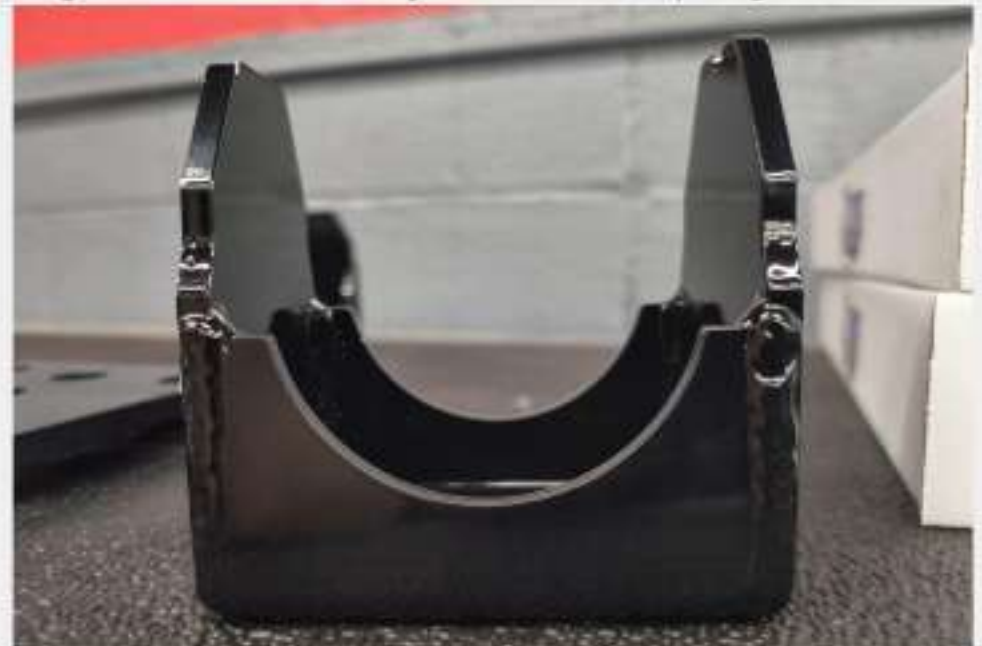
Figure 14: Flip Bracket