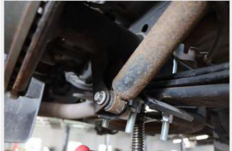
Figure 1: Rear Shock Removal

K) Using a 24mm socket and a 21mm wrench, remove the lower bolts from the rear leaf spring shackle. The leaf springs can now be removed from the truck with the shackles.