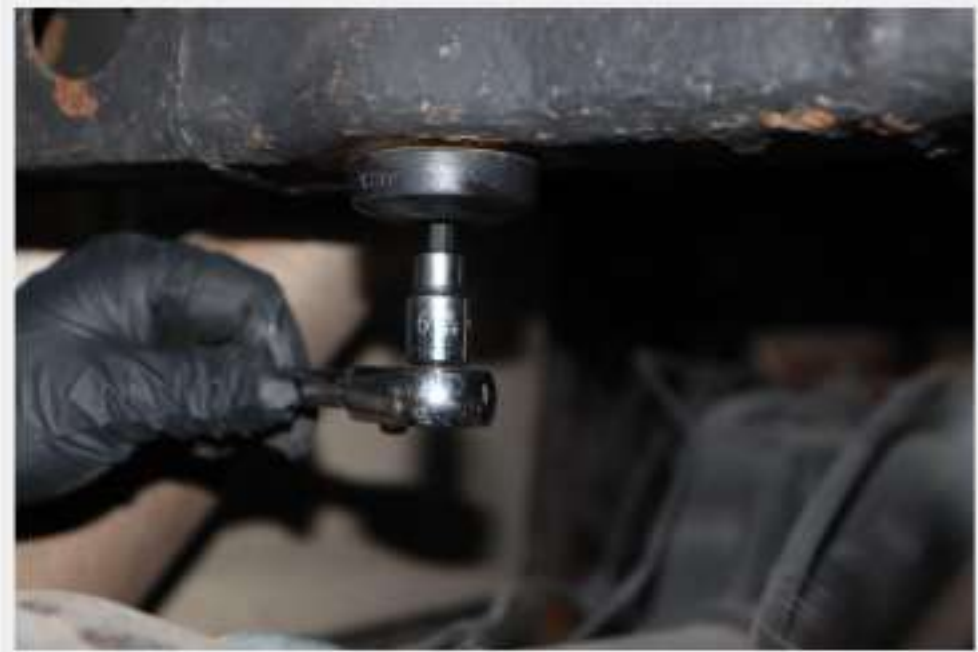
Figure 22: Install Bump Stops