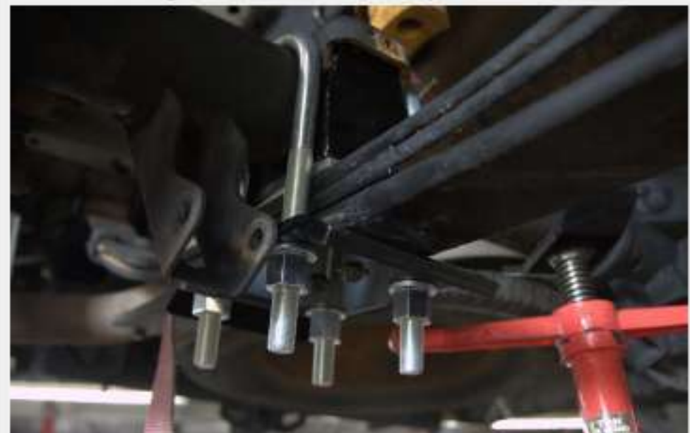
Figure 21: Install U-Bolts