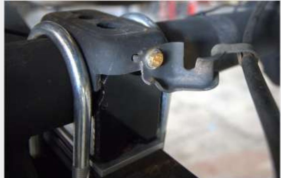
Figure 23: E-Brake cable mounts