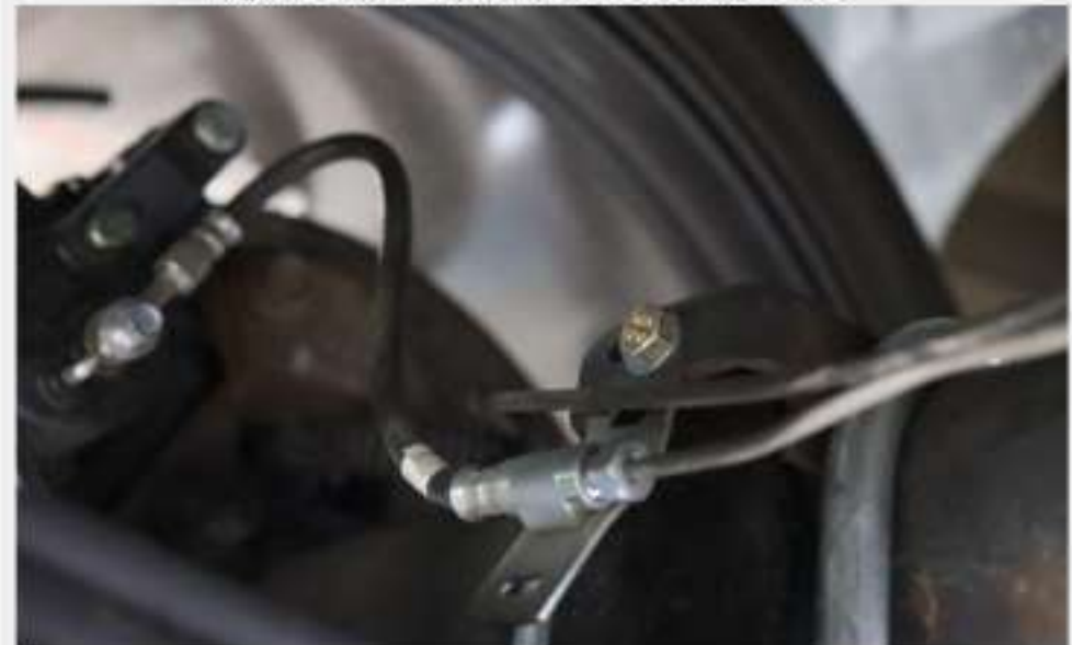
Figure 23b: Brake Line Mounts