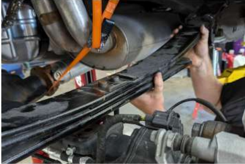
Figure 11: Leaf Spring Install

E) We are now ready to reinstall the leaf spring packs. Raise the rear differential up so that there is enough clearance to get the spring packs back in under the axle (Fig 11). Place