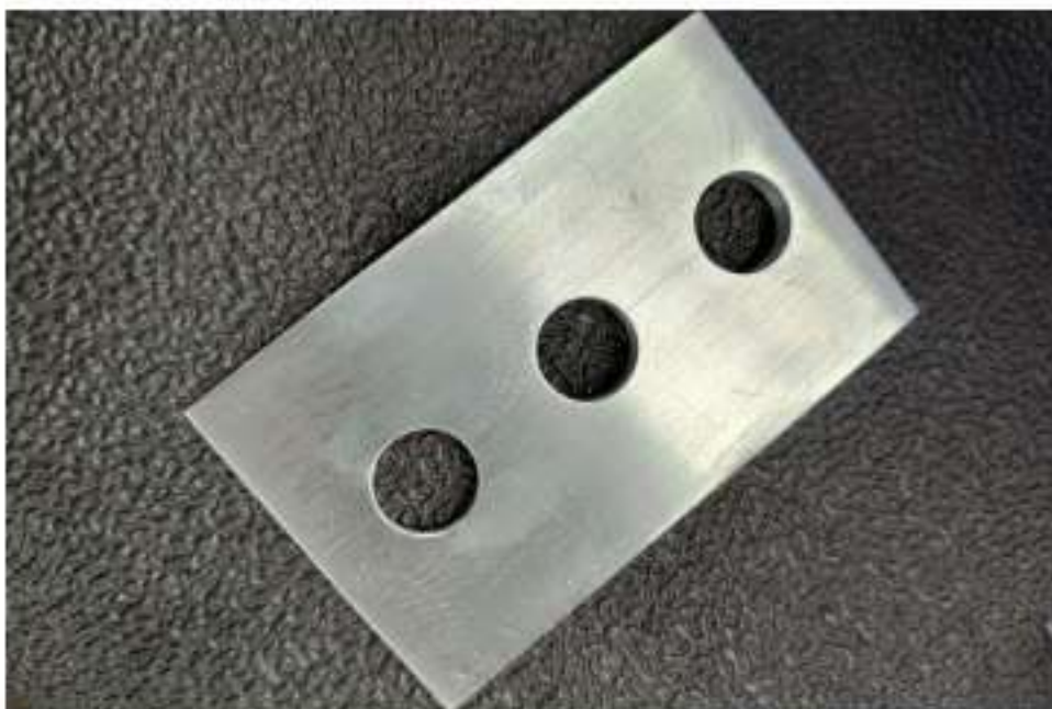
Figure 15: Install Angle Shim

H) Place the angle shim onto the spring pack with the thick side to the front (Fig 15).