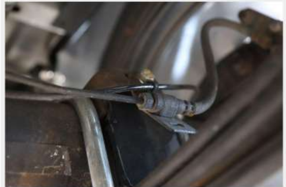
Figure 2: E-Brake cable mounts