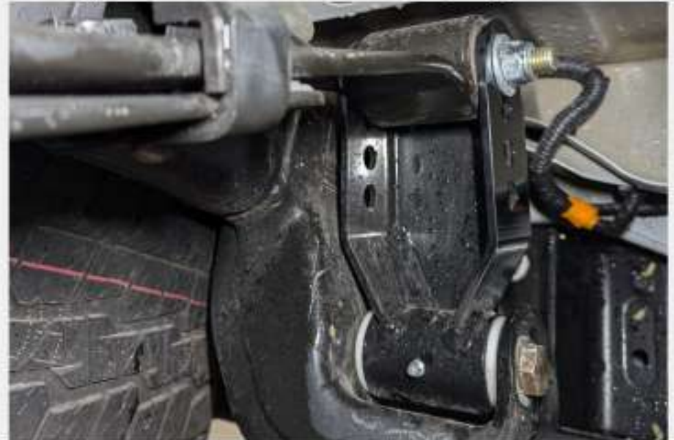
Figure 13: Installed Adjustable Leaf Spring Shackle