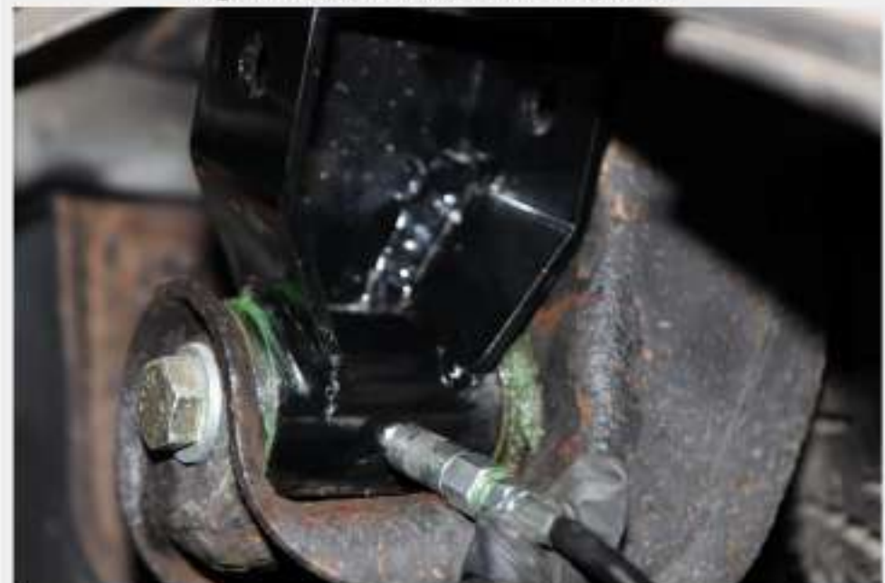
Figure 25: Grease Rear Spring Shackle