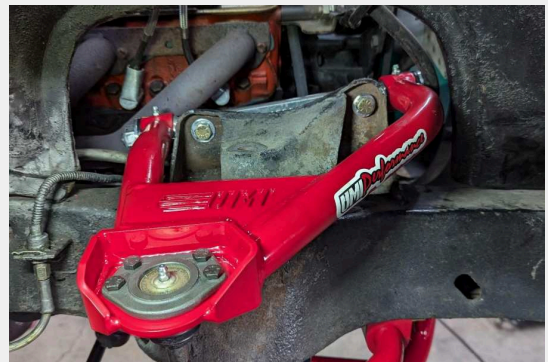
Figure 4: Upper arm installed torque frame bolts and ball joint.