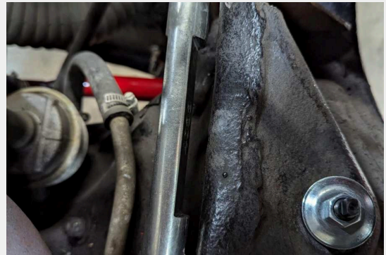
Figure 3: Cross shaft orientation