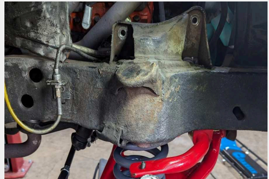
Figure 2: Upper control arm removed.